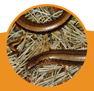
They look like snakes, but are actually legless lizards. Commonly found under objects in gardens.