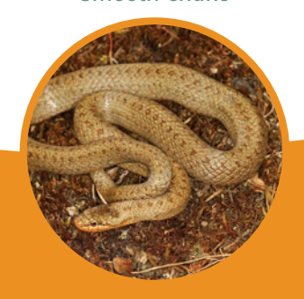
Britain's rarest snake with a limited distribution, only found on the southern English heaths.