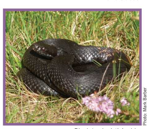
Black 'melanistic' adder